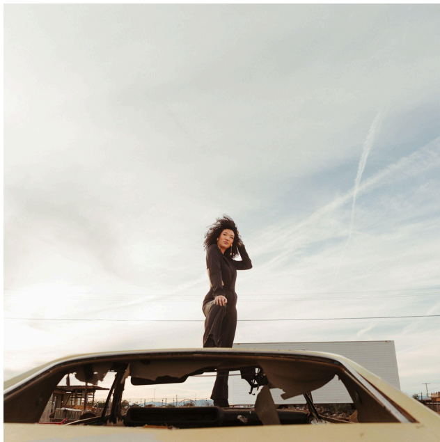
"Flame" Artwork | Hi-res HERE

May 11-12 - Stockholm, Sweden - Fasching May 17 - Copenhagen, Denmark - DR Concert Hall May 19 - Schöppingen, Germany - Bluesfestival Schöppingen May 21 - Zürich, Switzerland - Kaufleuten May 23 - Rubigen, Switzerland - Mühle Hunziken May 24 - Tübingen, Germany - Sudhaus May 29 - Sint-Niklaas, Belgium - De Casino Concertzaal May 30 - Paris, France - New Morning Jun. 1 - Weiz, Austria - Jazzfestival Weiz Jun. 4 - Almeria, Spain - Clasijazz Jun. 6 - Antalya, Turkey - Akra Jazzfestival